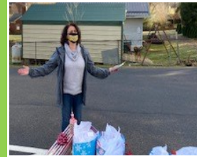
A Blessed Day!

“Be still and know that I am God.” Psalm 46:10