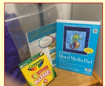
Each of the children in the NEST Kids Program received art supplies from the Florence Thomas School of Art. Thank you!