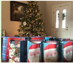
Gifts Are Ready

Due to the pandemic, our usual indoor “Happy Birthday, Jesus” Christmas celebration was not possible. As we worked to meet needs and to practice safe social distancing, we asked families to give us a list of Christmas wishes for the children we serve, and we placed online orders to purchase some of those wishes. The West Jefferson Methodist Church was gracious in allowing us to meet in their parking lot to distribute these gifts safely in an outdoor setting.