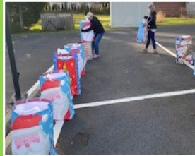
Sun is Still Shining