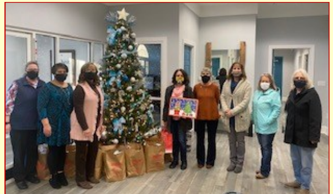
Thank you, Skyline National Bank, for the collection of food bags and boxes for children and their families this Christmas. Pictured are bank staff and directors of The NEST Alliance.