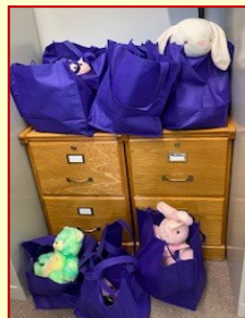
Thank you, Laurel Knob Baptist Church Youth Group for the care bags and gift cards.