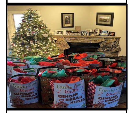
Christmas gifts were ready for all NEST Kids. We were able to supply needs, as well as wishes, for 24 children and youth because of wonderful donors. Thank you, Donors!

"In our hearts we know that a gift to a child done with great care and love - explains itself." -From The NEST Twig Collection