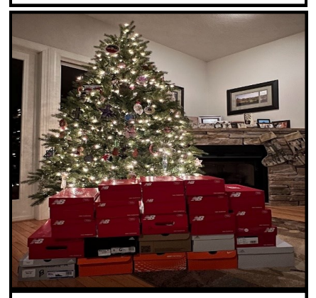
New pairs of shoes for 24 NEST Kids were furnished through our ongoing connection with Shoes for Kids. Thank you, Melody Rector and Shoes For Kids!