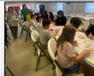
NEST Kids (left) work together to complete a project.

“For I know the plans I have for you, declares the LORD, “plans to prosper you and not to harm you, plans to give you hope and a future.” Jeremiah 29:11 (NIV)