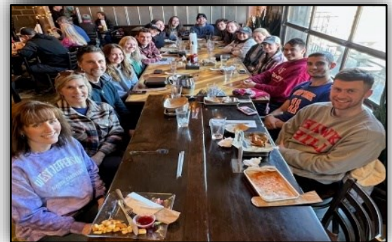
College students in the St. Joseph's University APEX Program (above) stop for lunch as they volunteer as a team to help at The NEST Center. Teamwork works!

Missions: NEST Kids, NEST Net, Roots & Wings Children's Homes