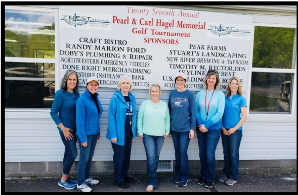
The NEST Alliance Board of Directors